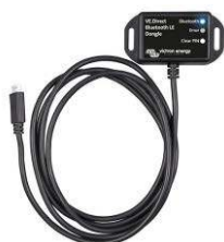
VE.Direct Bluetooth Smart dongle (must be ordered separately)

An excessively high or low battery voltage is indicated by an audible and visual alarm, and a relay for remote signalling.