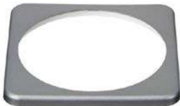
BMV bezel square