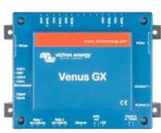
Venus GX The Venus GX provides intuitive control and monitoring. It has the same functionality as the Color Control GX, with a few extras: - lower cost, mainly because it has no display or buttons - 3 tank sender inputs - 2 temperature inputs