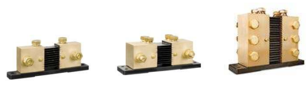
1000A/50mV, 2000A/50mV and 6000A/50mV shunt The quick connect PCB on the standard 500A/50mV shunt can also be mounted on these shunts.