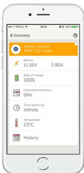
See the VictronConnect BMV app Discovery Sheet for more screenshots