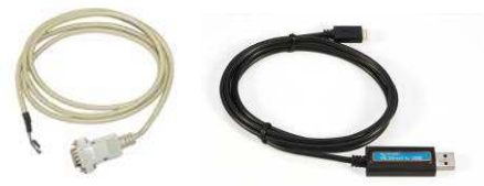
Interface cables - VE.Direct cables to connect a BMV 712 to the Color Control (ASS030530xxx) - VE.Direct to USB interface (ASS030530000) to connect several BMV 70x to the Color Control or to a computer.