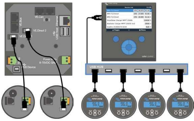
A maximum of four BMVs can be connected directly to the Color Control. Even more BMVs can be connected to a USB Hub for central monitoring.