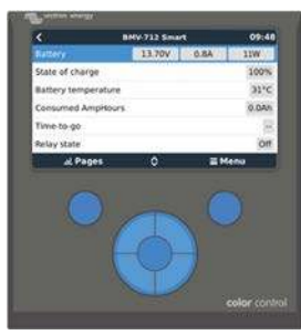
Color Control The powerful Linux computer, hidden behind the colour display and buttons, collects data from all Victron equipment and shows it on the display. Besides communicating with Victron equipment, the Color Control communicates through CAN bus (NMEA2000), Ethernet and USB. Data can be stored and analysed on the VRM Portal.

If needed, several balancers can be paralleled. A 48V battery bank can be balanced with three Battery Balancers.