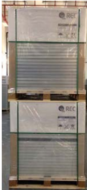
Double pallet stack

Note: Pallets delivered stacked are not bound together