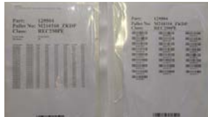
Flash Data List Serial Number List